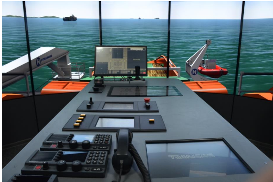
Fig. 2. Simulator "Command bridge".

Another example of implementing multimedia-visualization is simulator «Heavy Lift». 12 big displays and 8 computers create virtual reality of student's presence in the cage of heavy lift for loading a vessel. Workplace equipment is the same to a real heavy lift. Work of computers, displays and equipment allows full virtual execution of loading-unloading task. Simulator creates real situations which can take place on real workplace. Modeling various work situations a teacher can help to create or precisely check the quality of graduate's formed competencies.