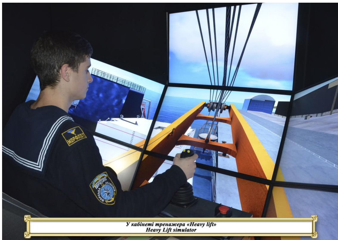
Fig. 3. Simulator «Heavy Lift».

Another example of implementing multimedia-visualization is simulator «Heavy Lift». 12 big displays and 8 computers create virtual reality of student's presence in the cage of heavy lift for loading a vessel. Workplace equipment is the same to a real heavy lift. Work of computers, displays and equipment allows full virtual execution of loading-unloading task. Simulator creates real situations which can take place on real workplace. Modeling various work situations a teacher can help to create or precisely check the quality of graduate's formed competencies.